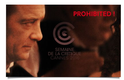
No dark monochrome logo on dark background. The logo must stay monochrome.